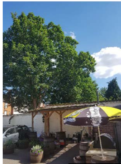
Sycamore, as seen from the Nags Head car park