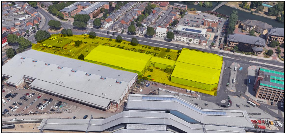
Application site highlighted - Looking North