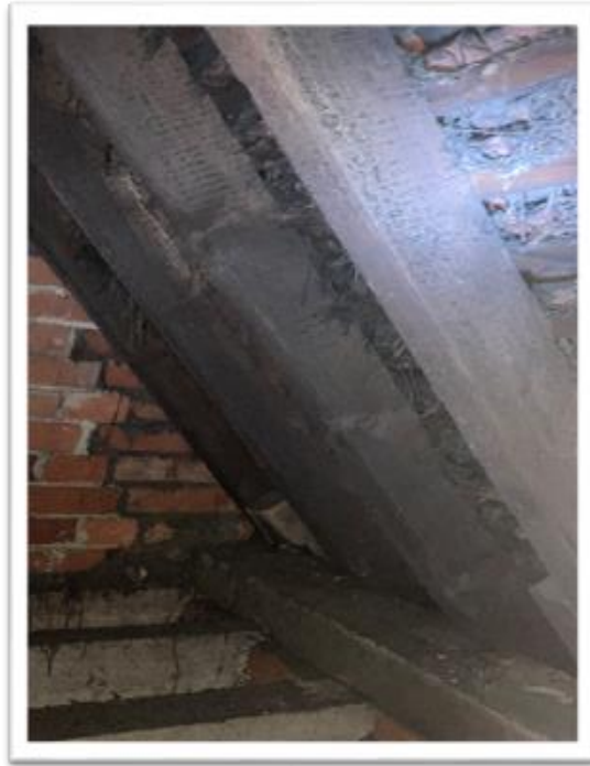
Photo 5 & 6: Remains of possible straw and plaster torching below tiles where roof voids accessible.