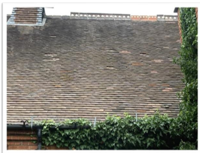
Photo 1: Ridges tiles are broken or have been replaced with a poor match. (Original ridge tiles centre)