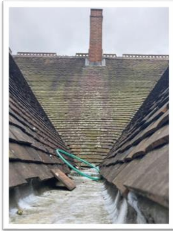
Photo 2: Typical lead gutter between roofs (Also show further tile & ridge damage)