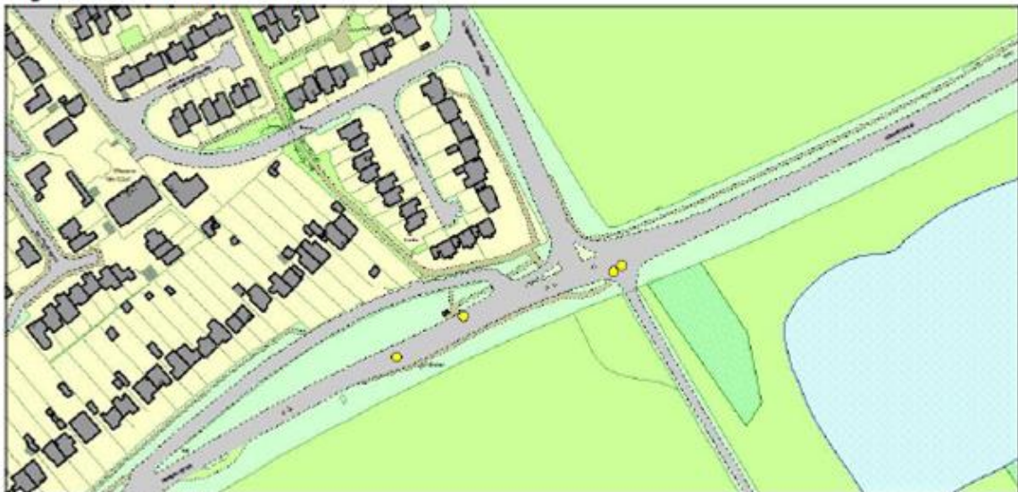
Figure 3.1 PIA Locations

The PIA data outlined that for the area around the Access Road / Henley Road / Caversham Park Road junction a total of four accidents were recorded. The location of these accidents is outlined by the yellow dots in Figure 3.1 below, which has been taken from the Transport Technical Note.