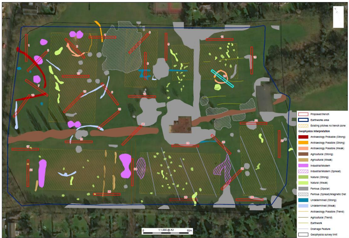
Figure 2: Caversham Playing fields, Mapledurham. Proposed Trench plan with geophysical interpretation