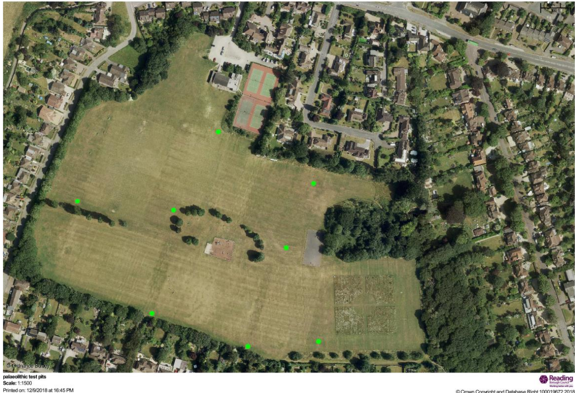
Plan 4.1.3: 8no Palaeolithic test pit locations