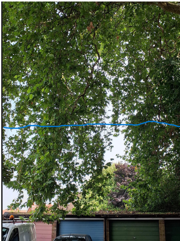
indicative crown lift above garage