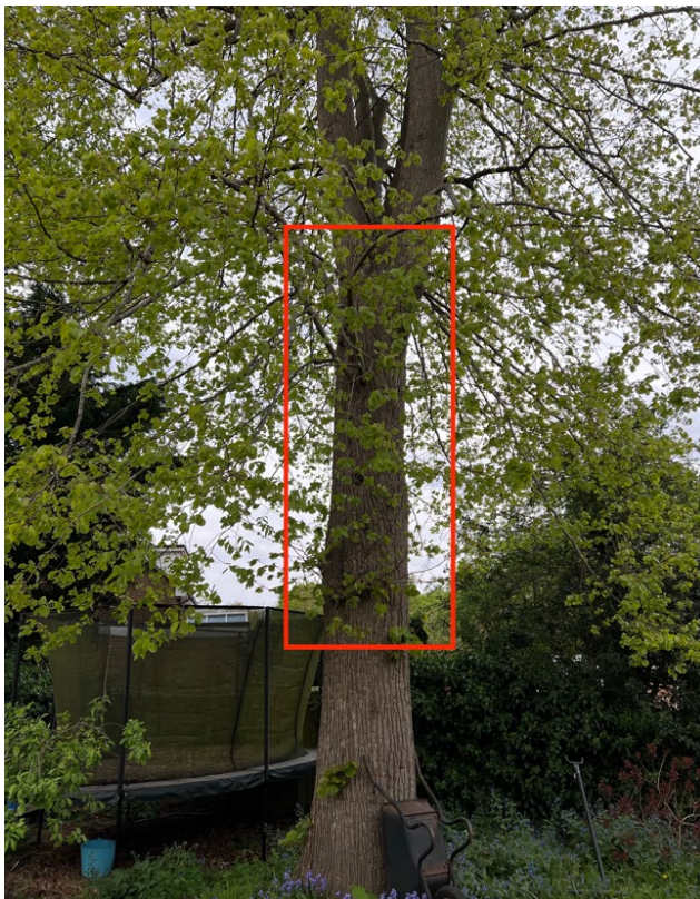
Area from which branches will be removed